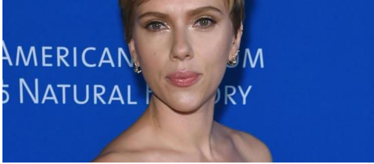
Scarlett Johansson is one of the few to boast the highly sought-after symmetrical lip shape

In the study, which was published in the Journal of Cranio-Maxillofacial Surgery , more than 60 per cent of respondents chose the 1:1 ratio between the upper and lower lip as the most attractive shape.