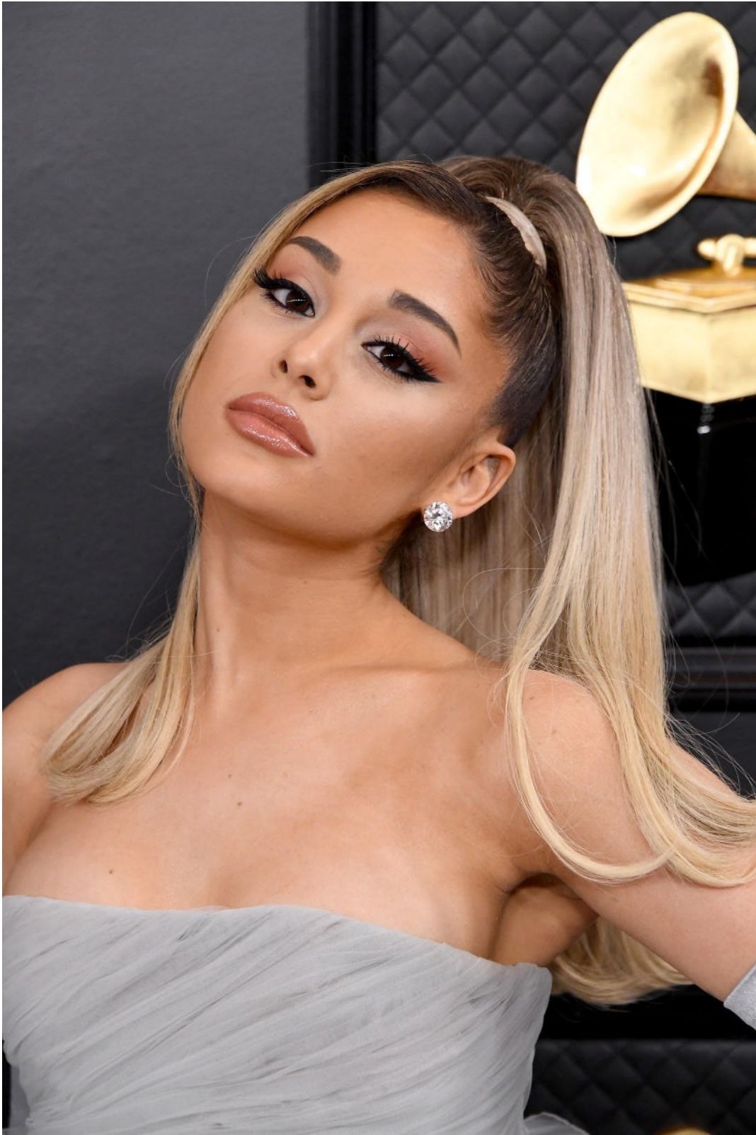
Singer Ariana Grande's face was scored a 91.81 per cent match